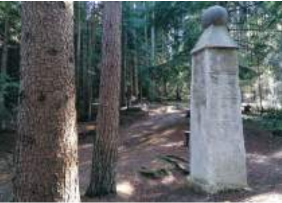
Olovo - Bosnia

Thanks to the work carried out in the course of ADRIONET, the characteristics of the villages outlined above have been integrated and declined in the innovative concept of the “Hospitable Community”. The community itself assumes the role of both the driving force of local development and at the same time the organiser - around its resources and values - of widespread and experiential hospitality. Transnational cooperation should then enable the small villages involved to be linked together and assume transnational visibility. The territorial enhancement of areas of high value, but vulnerable and exposed to the risk of abandonment and therefore depopulation, such as those affected by ADRIONET, requires a complex interaction