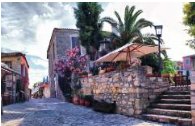
Afitos - Grecia

Finally, the creation of new job and business opportunities in rural areas through tourism requires a holistic approach involving all other sectors and activities in the tourism value chain and promoting Public-Private-Community (PPC) partnerships. However, realizing these opportunities requires an integrated and sequential strategic approach to tourism for rural development with a long-term vision towards 2030 and beyond.