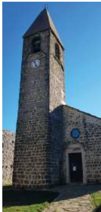
Hrastovlje - Slovenia

The main objective of the project was then to overcome the current marginalisation, fragmentation and underestimation of these territories. The establishment of a transnational network of ‘authentic villages’, is therefore aimed at promoting the conservation of natural and cultural assets by pursuing a development based on social, environmental and economic sustainability. The quality of life and well-being of the local populations are at the centre of the process, as a prerequisite for the pervasive care of the landscapes concerned, as well as the attraction and satisfaction of visitors.