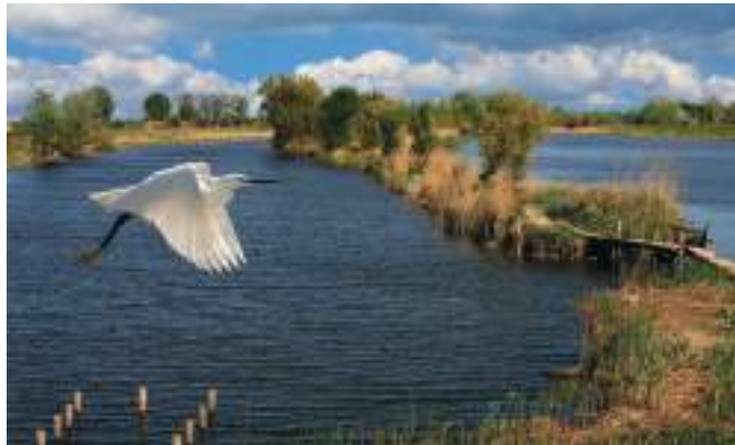
Belo Blato - Serbia

As has been reported in the regional reports of many project partners, the COVID-19 pandemic has triggered a growing interest on the part of tourists seeking new experiences based on natural and rural open-air areas away from congested settings. This, combined with the already demand for more authentic experiences that offer greater engagement with local communities, their culture and products, as well as demand for a greener approach in all stages of the travel experience, opens