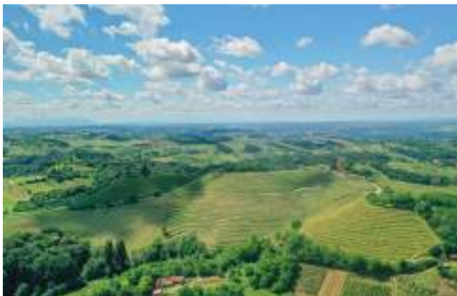
Strigova - Croazia